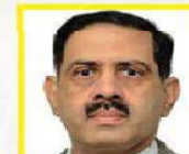
PROF BALRAM BHARGAVA DG, ICMR & Secretary, DHR