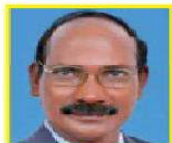
DR K SIVAN Chairman, ISRO & Secretary, DOS