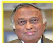
DR VIJAY P BHATKAR President, Vijnana Bharati